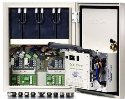
Inside look, (with optional battery module installed)